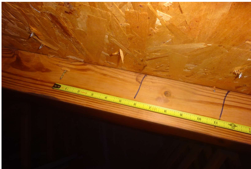
6" spacing in the field